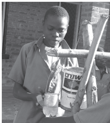
Learners wash hands after visiting toilet

- Wash hands with soap. Using the hand washing facility